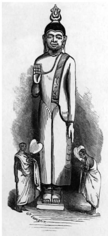
BUDDHA AND PRIESTS.