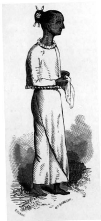
PROFILE OF CINGALESE WOMAN.