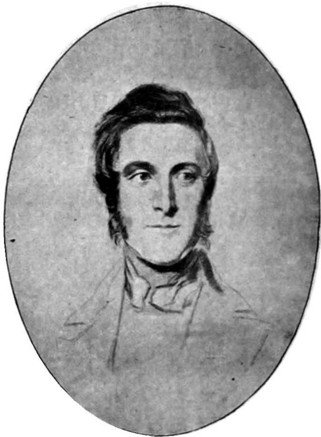
THE MARQUIS OF DALHOUSIE.