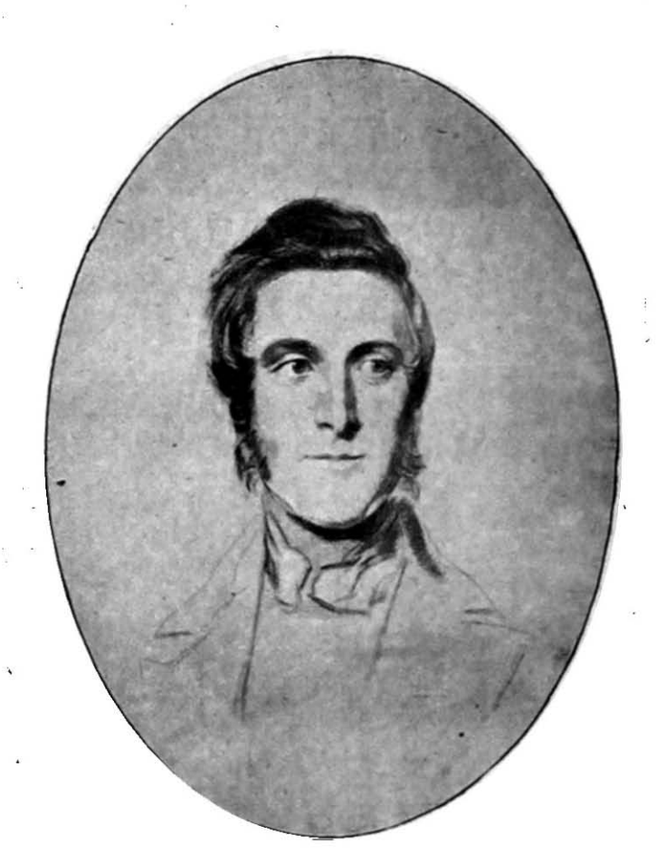
THE MARQUIS OF DALHOUSIE.