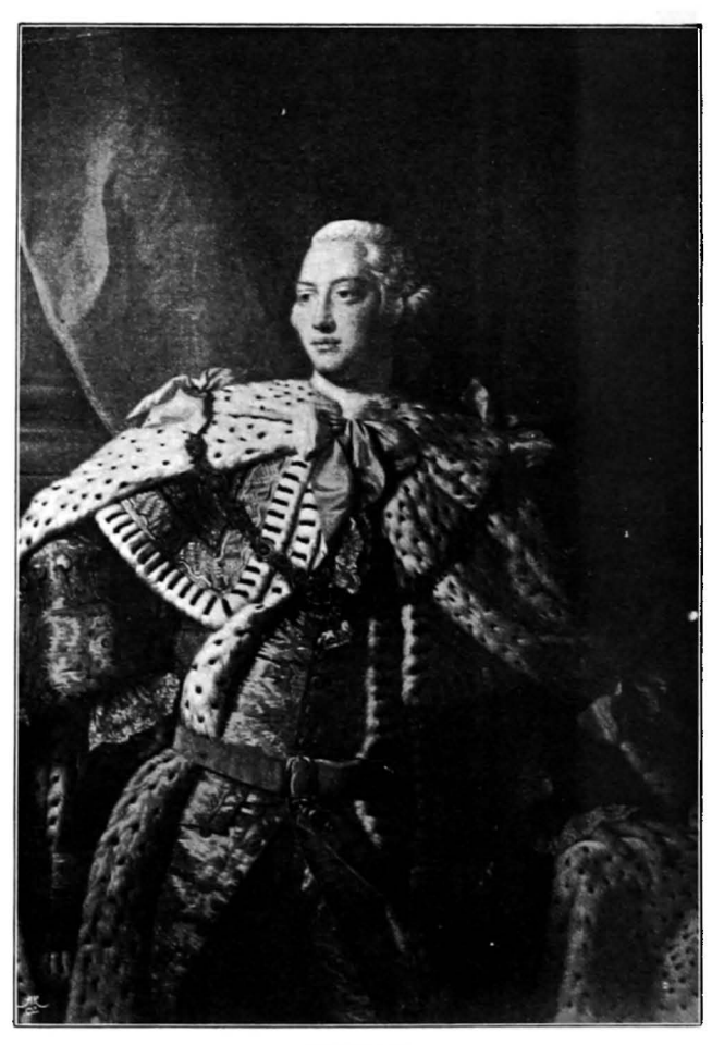
GEORGE III. (1738–1820.)