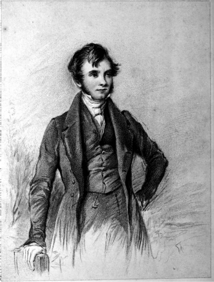
SAMUEL WILBERFORCE, Aged 29.