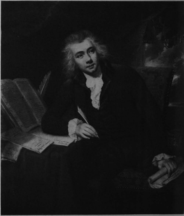
WILLIAM WILBERFORCE, M.P. FOR THE COUNTY OF YORK.