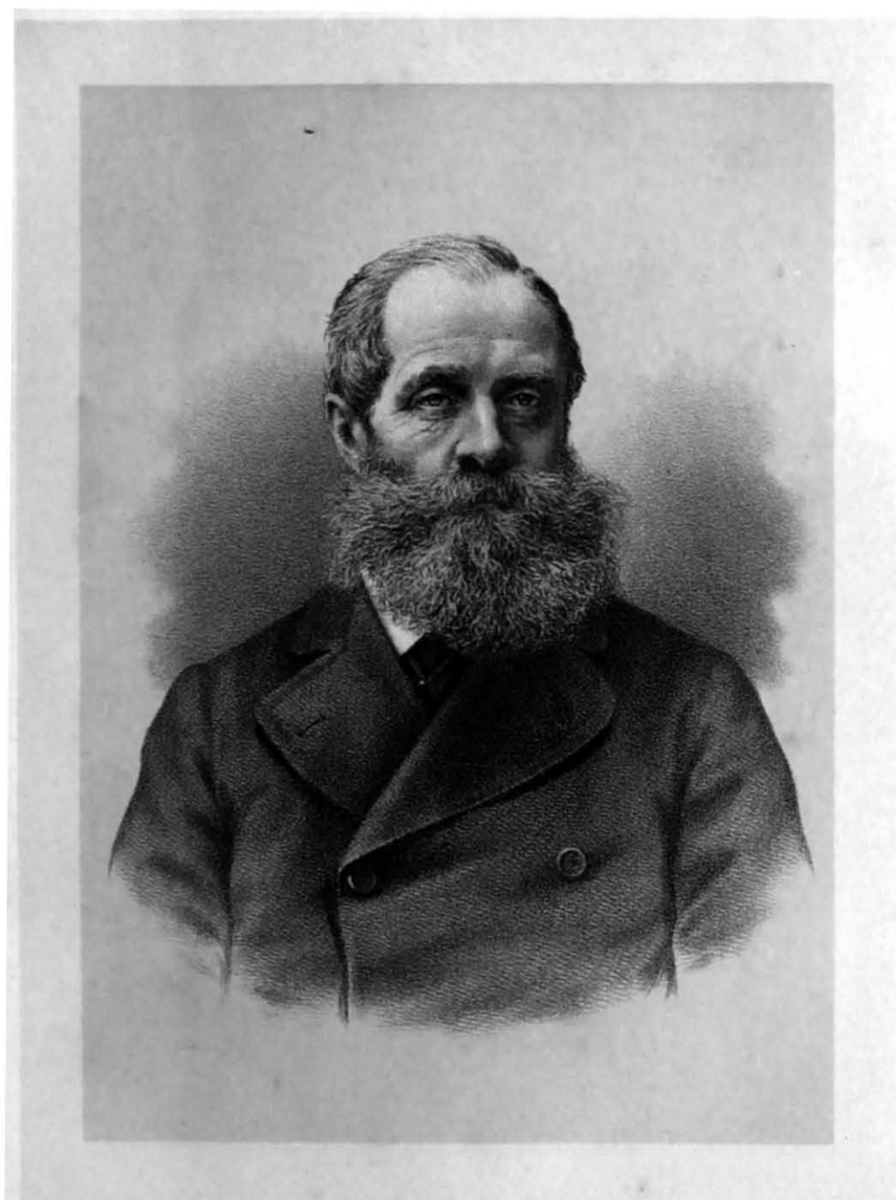
JOHN POYNTZ SPENCER. 5TH EARL SPENCER.

BLACKIE & SON, LONDON, GLASGOW, EDINBURGH & DUBLIN.