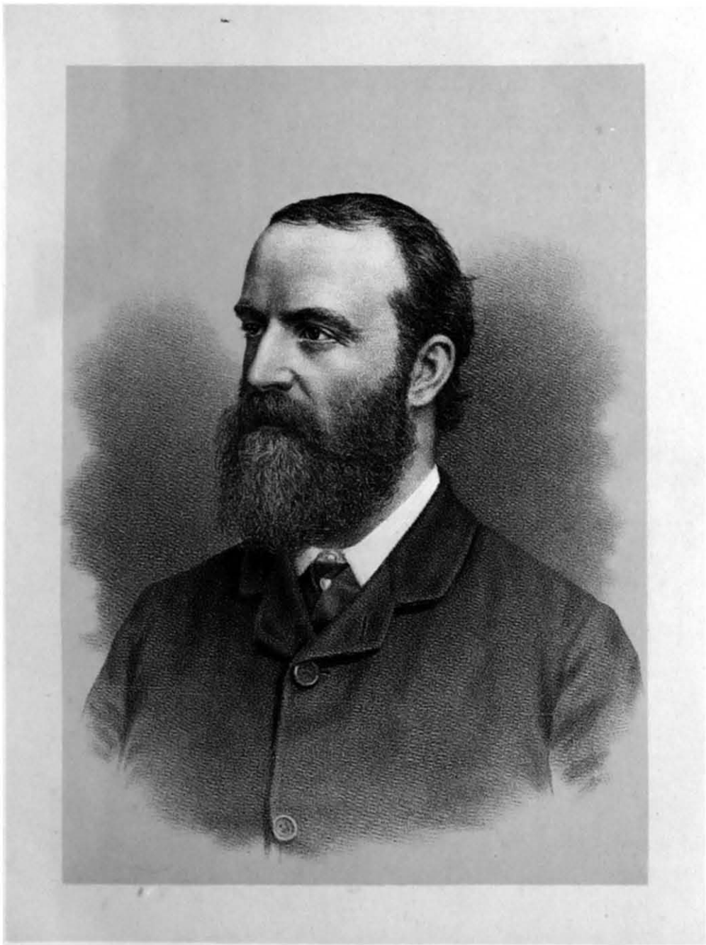
CHARLES STEWART PARNELL.