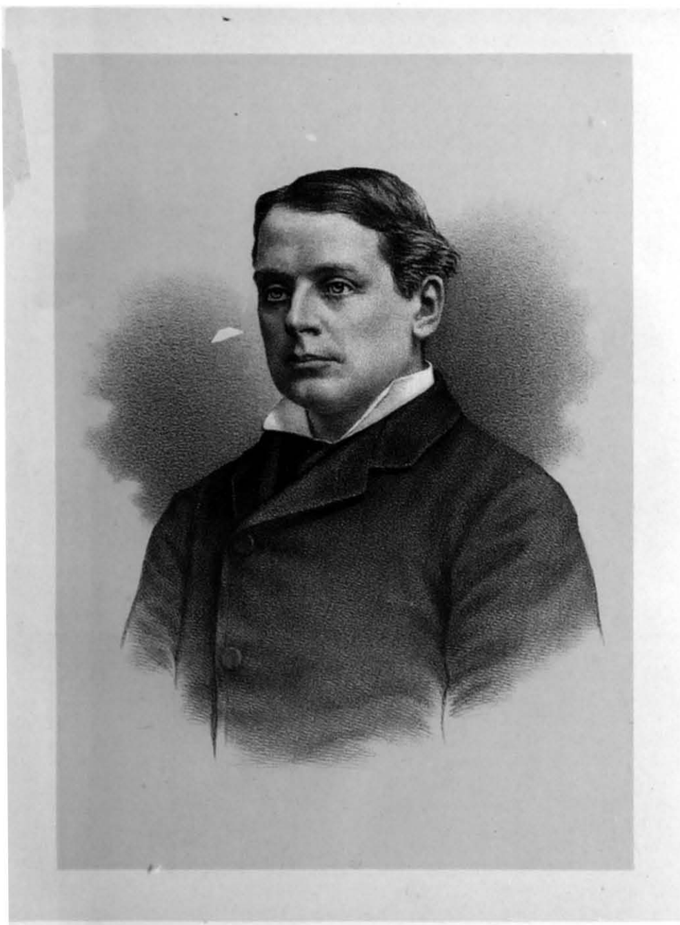
ARCHIBALD PHILIP PRIMROSE, 5 TH EARL OF ROSEBERRY.