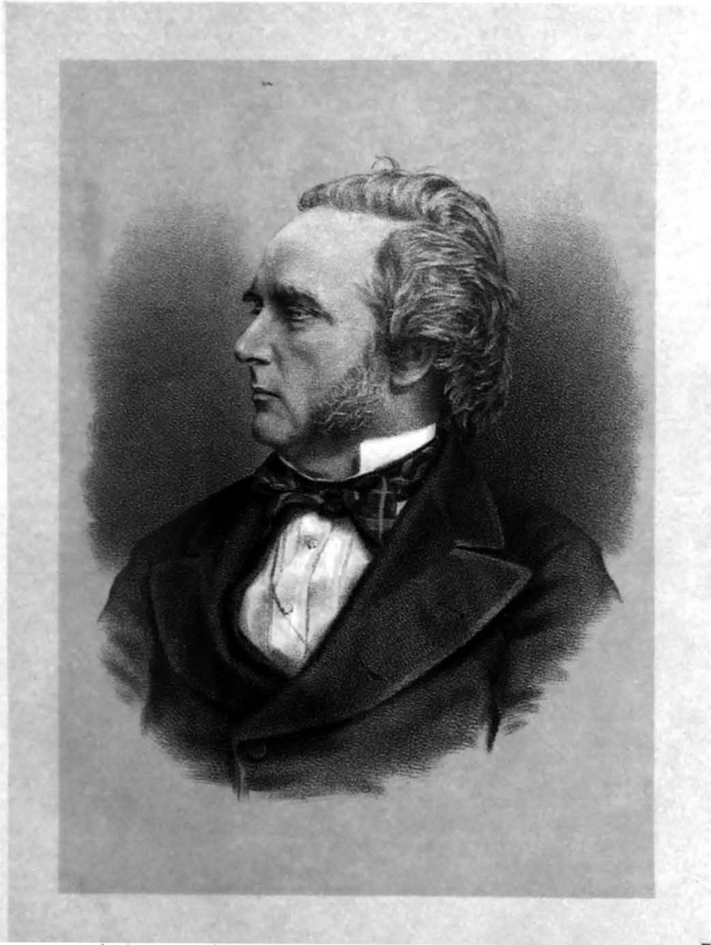
GEORGE DOUGLAS GLASSELL-CAMPBELL EIGHTH DUKE OF ARGYLE