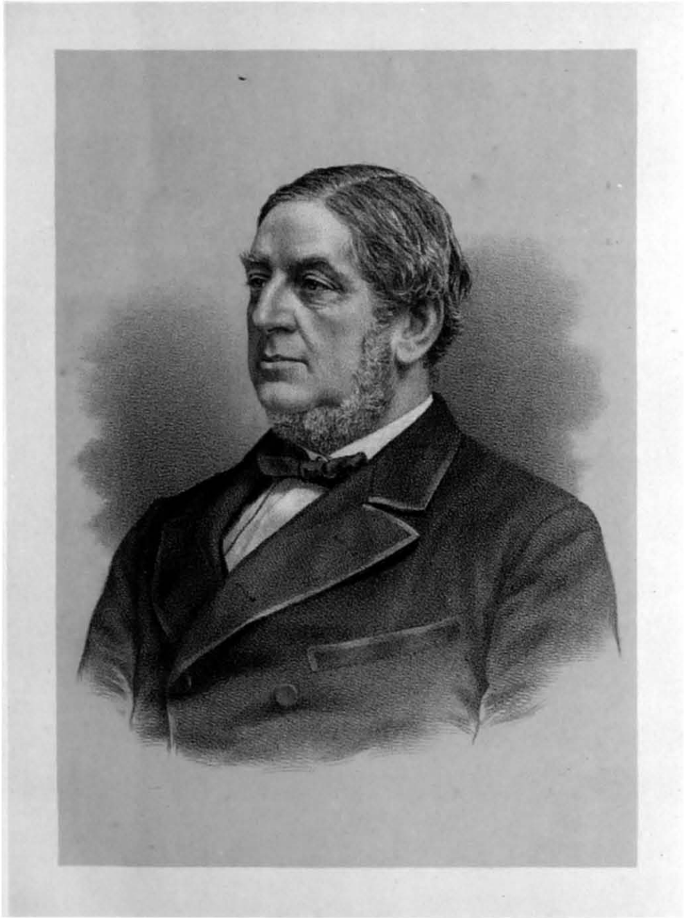
SIR WILLIAM VERNON HARCOURT.