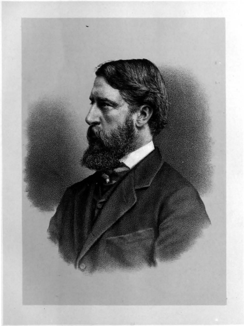
SPENCER COMPTON CAVENDISH. MARQUIS OF HARTINGTON.

BLACKIE & SON, LONDON, GLASGOW, EDINBURGH & DUBLIN.