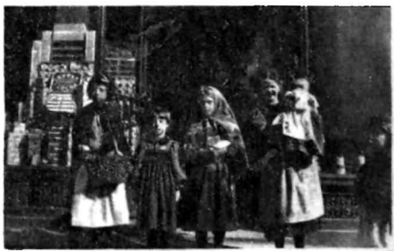
Little customers at the Store.