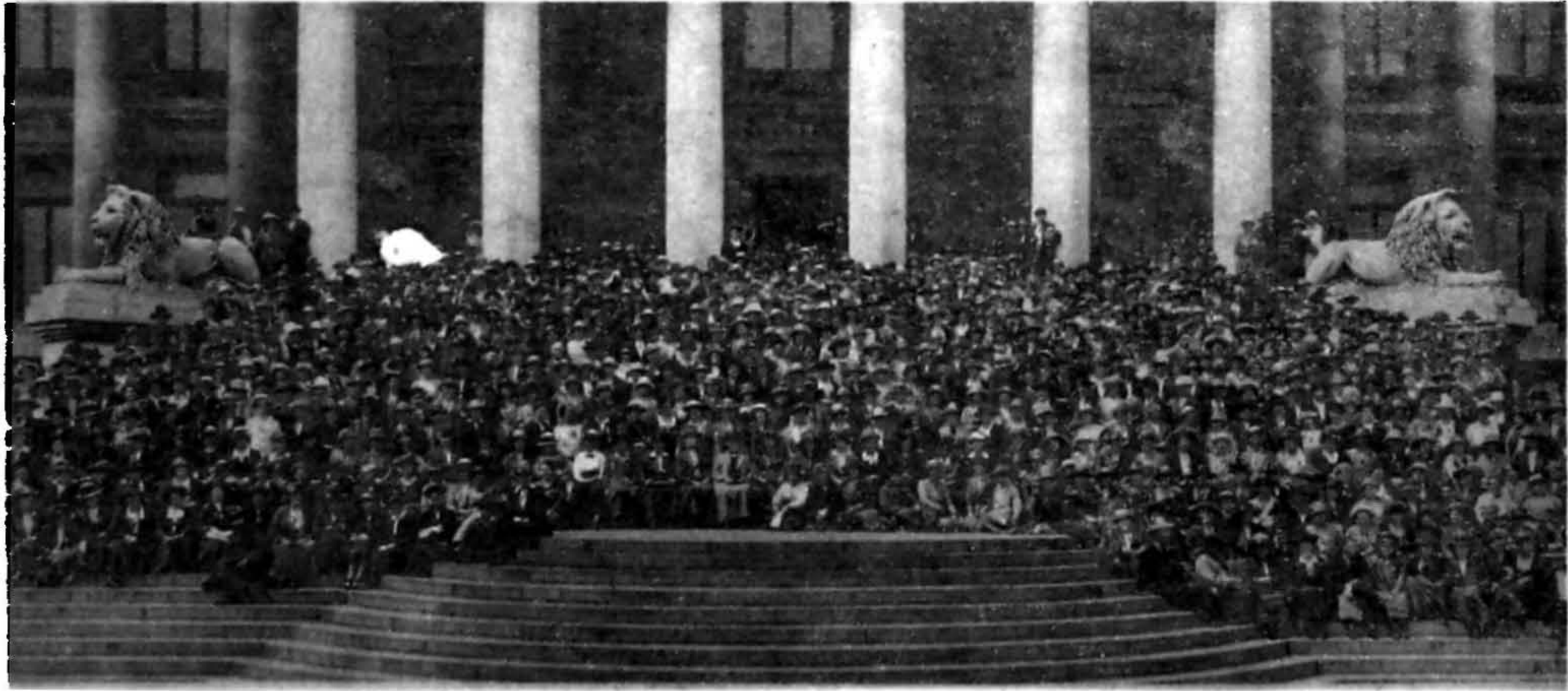
A TYPICAL CONGRESS CROWD (PORTSMOUTH, 1922).