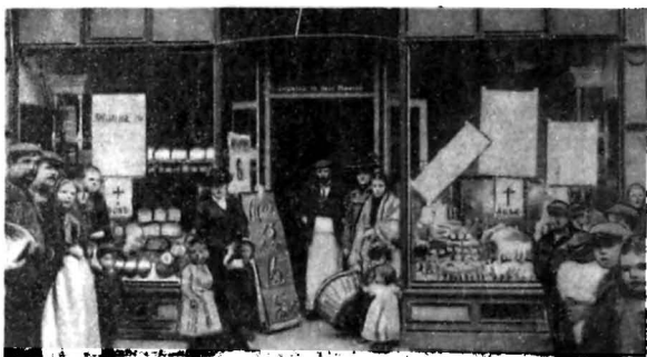
Coronation Street Store.