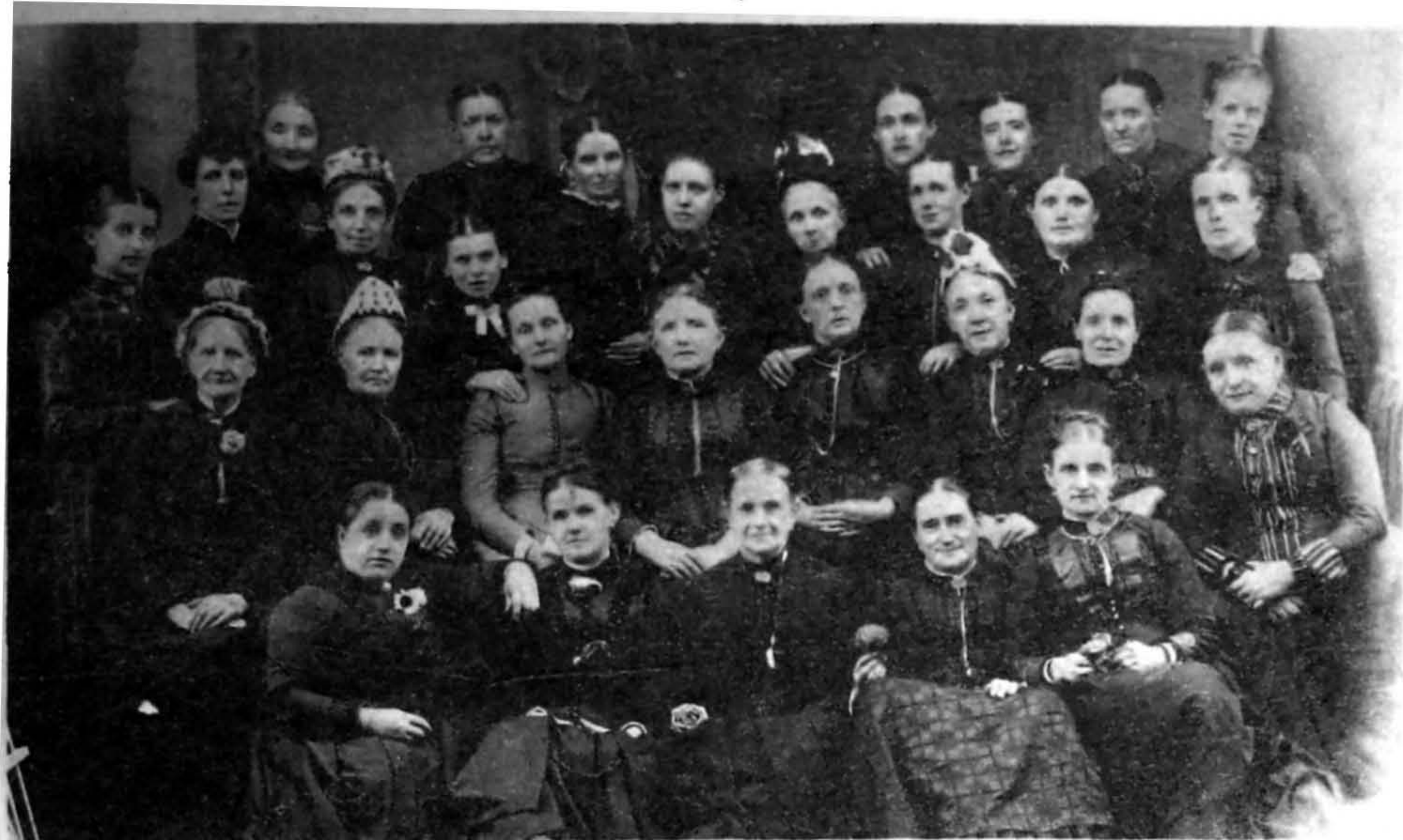
A TYPICAL GROUP OF MEMBERS OF A NORTHERN GUILD BRANCH, ABOUT 1889.