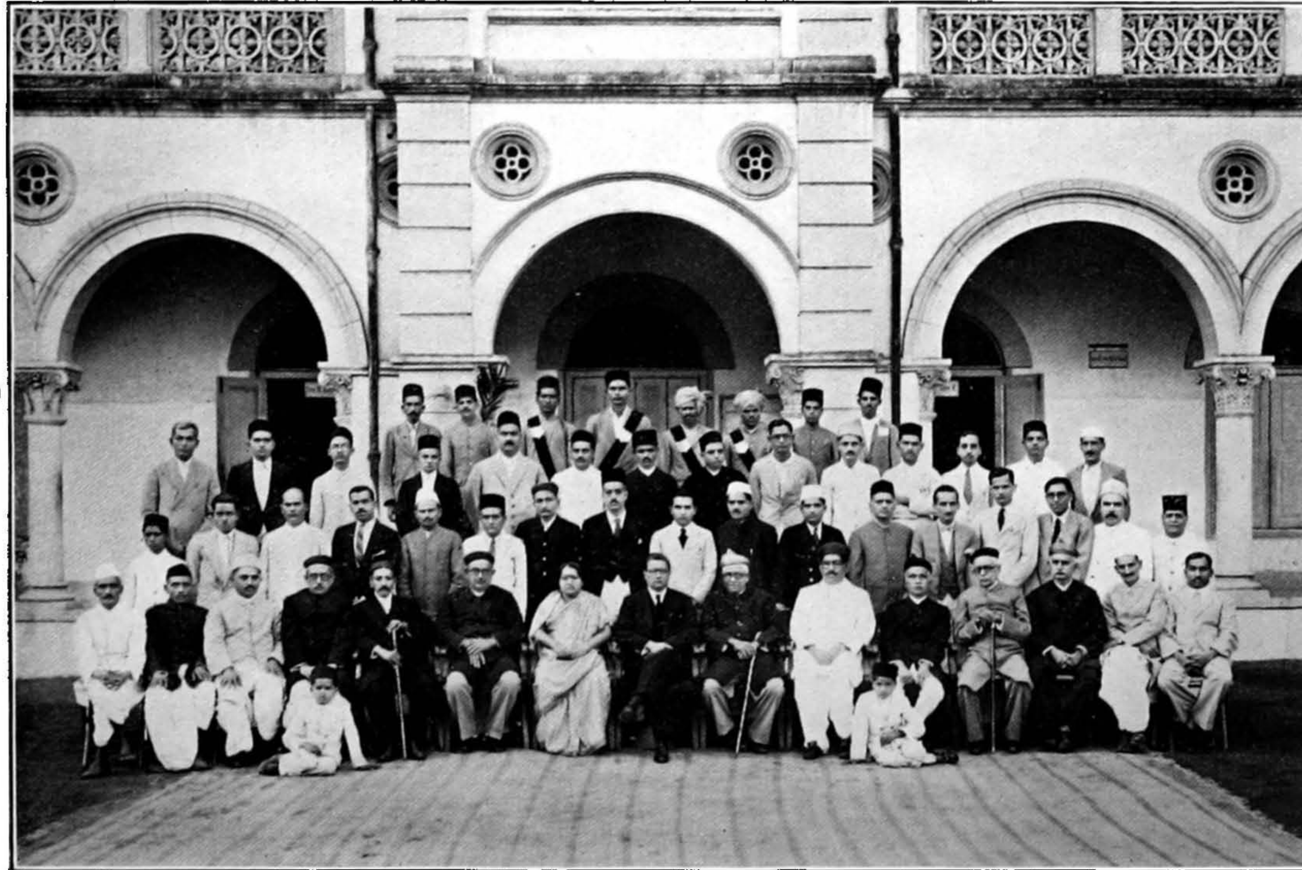
Members of the Staff and the Board of Directors with the President-Elect.