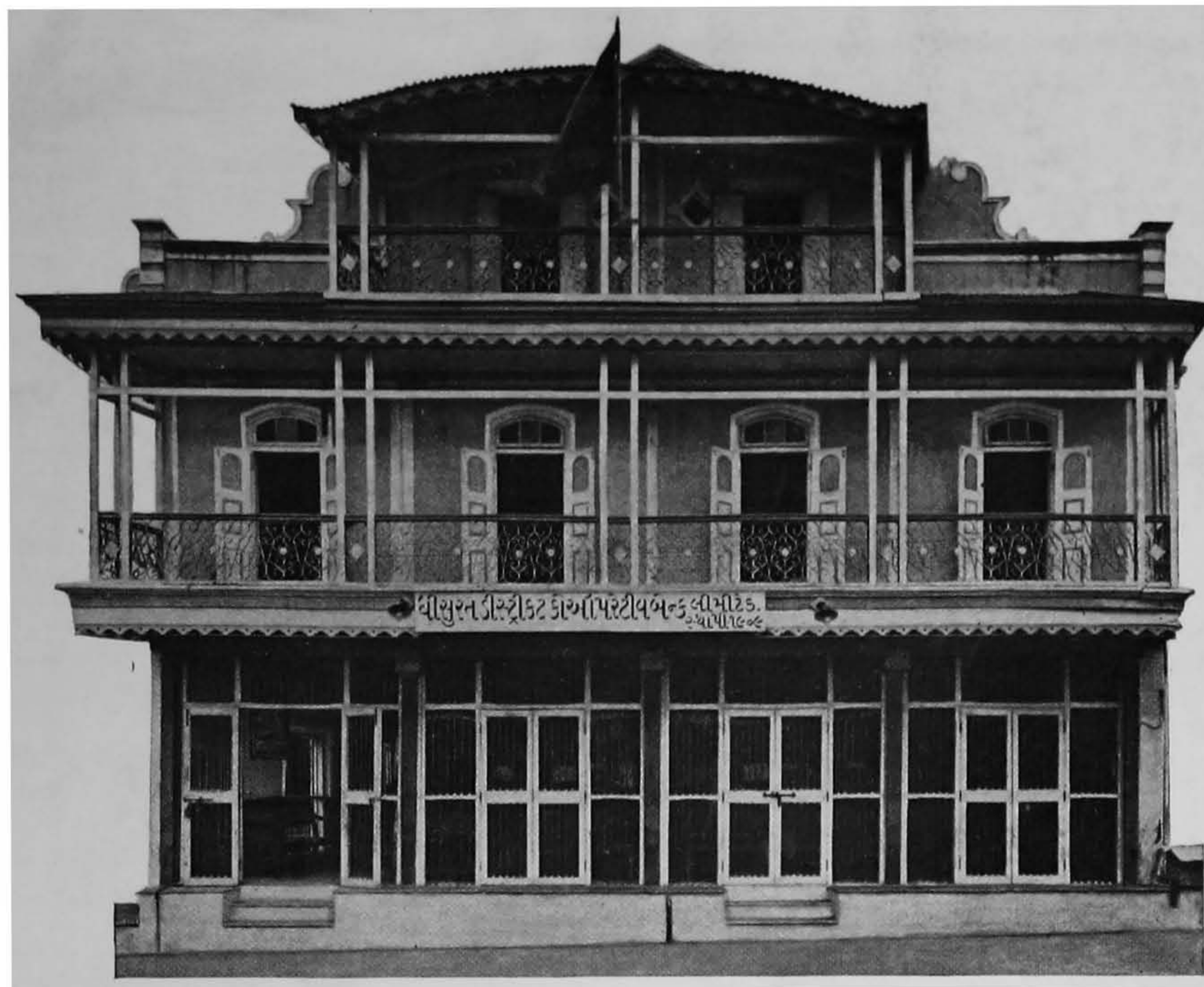
Bank's own Building at Kanpith, SURAT.