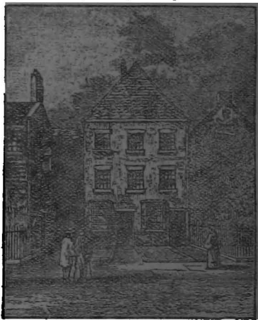
THE PIONEER STORE IN ITS ORIGINAL STATE, 1844.