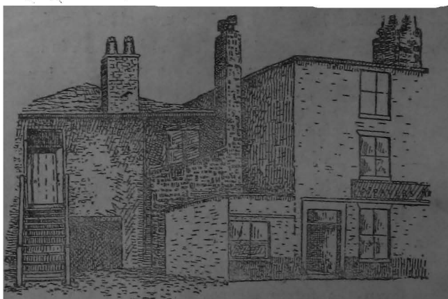
THE SOCIALISTS' INSTITUTE.