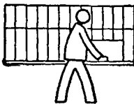
DEPOSITS IN ALL SAVINGS BANKS