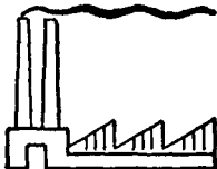
LOANS BY ALL BANKS IN THE UNITED STATES