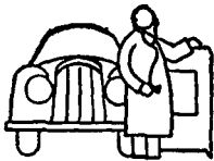
TOTAL CONSUMER CREDIT