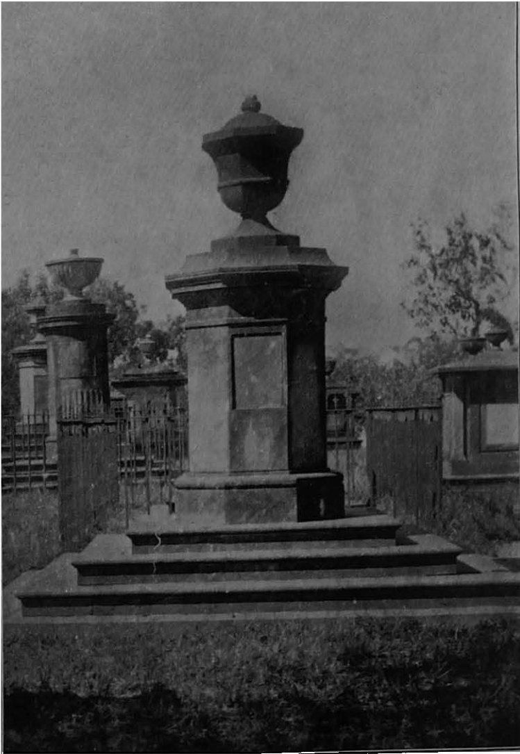
TOMB OF WILLIAM AUGUSTUS BROOKE AT SIKRAUL (BENARES.)

Photo engraved & printed at the Office of the Survey of India, Calcutta, 1923.