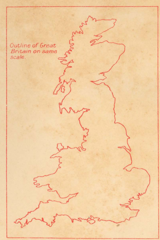
Outline of Great Britain on same scale.

NOTE:- The places printed in red were visited by the Committee during the course of their tour.