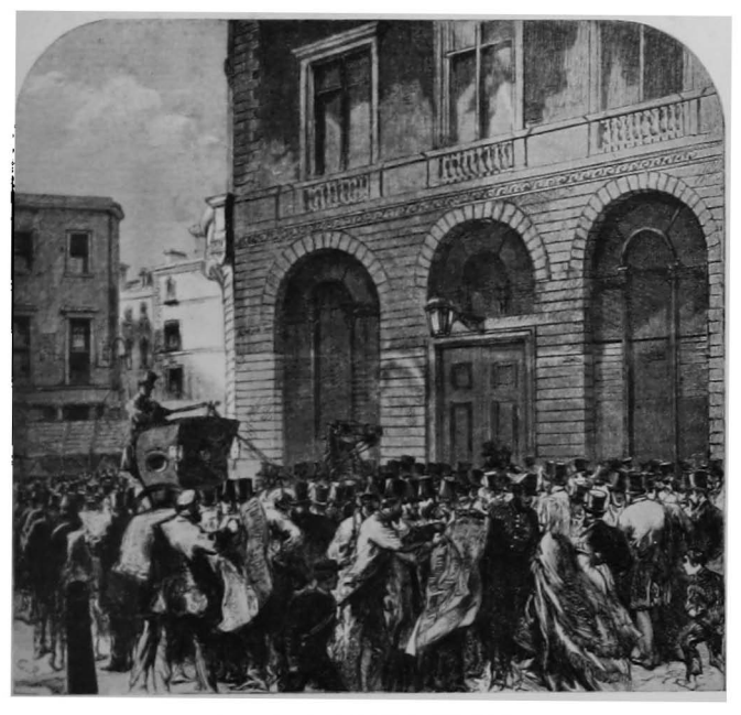
PANIC IN LOMBARD STREET (Reproduced from Illustrated London News, May 19, 1866)