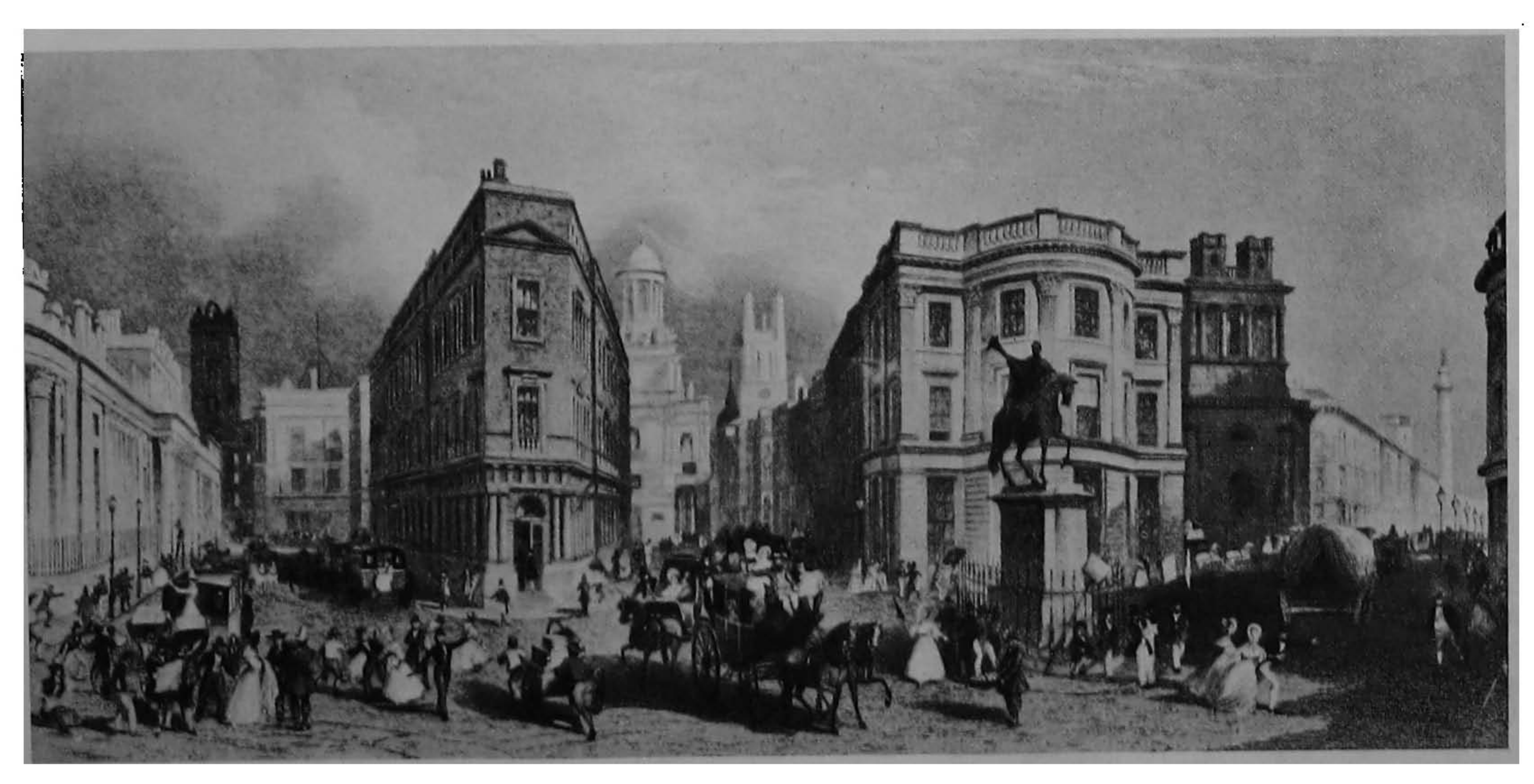
THE BANK AND MANSION HOUSE, KING WILLIAM STREET, 1850 .