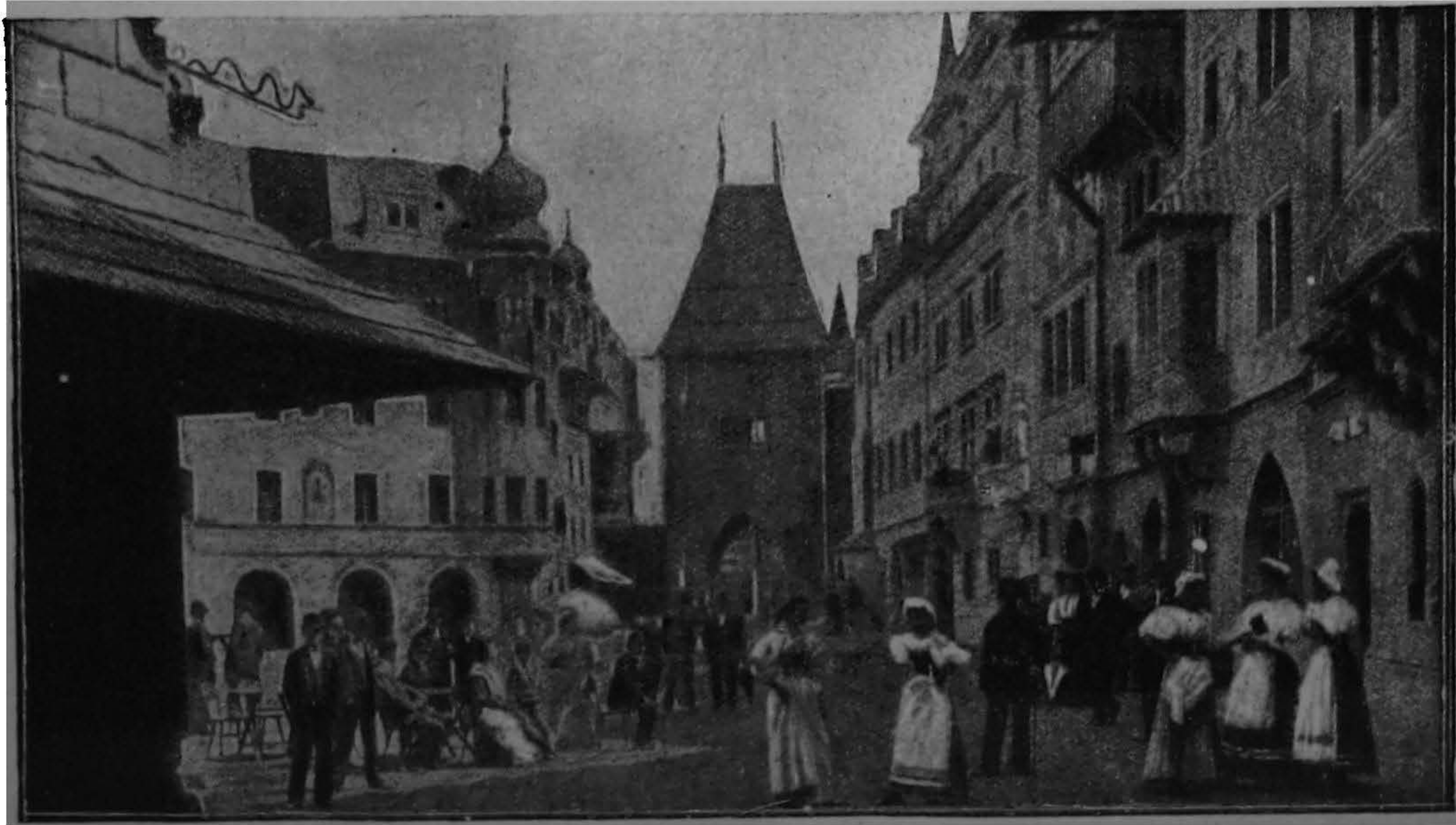
SMALL RING OF PRAGUE.