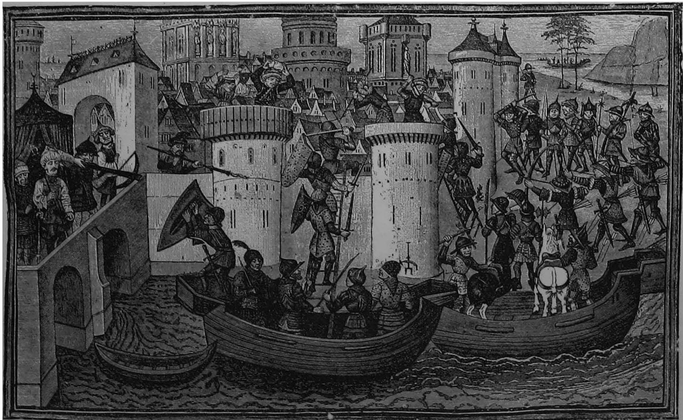
SIEGE OF CONSTANTINOPLE.