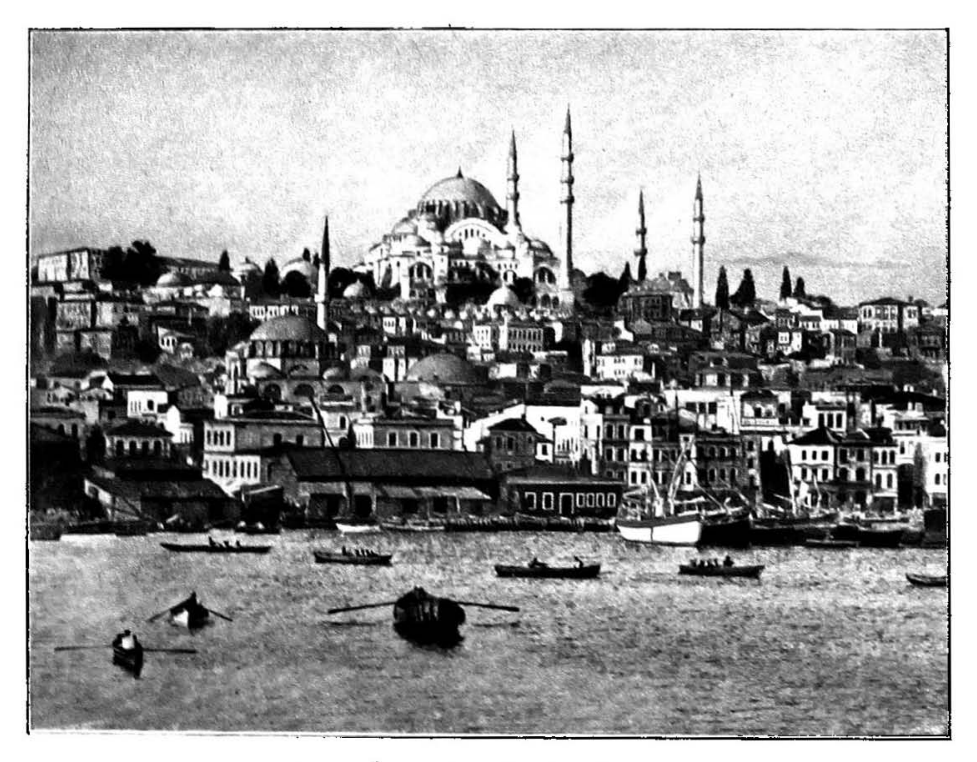
STAMBÛL AND THE GOLDEN HORN.