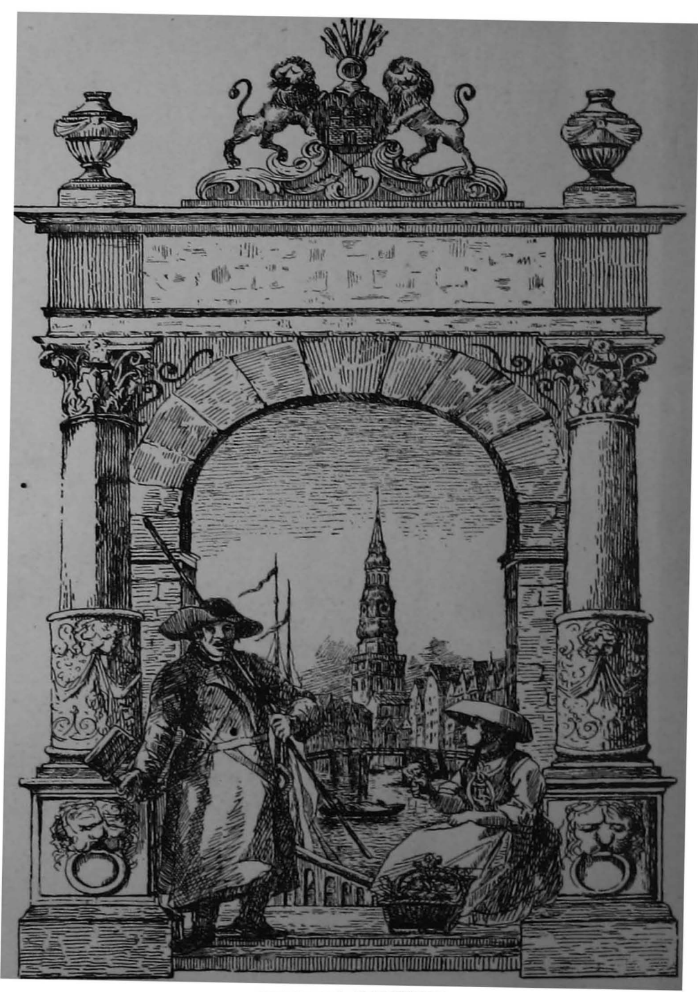
VIEW OF HAMBURG.