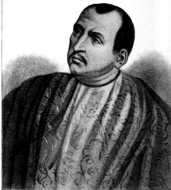
BERTRAND DU GUESCLIN