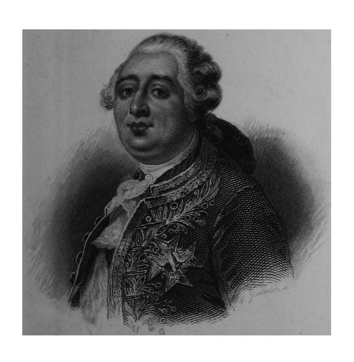
LOUIS THE SIXTEENTH.