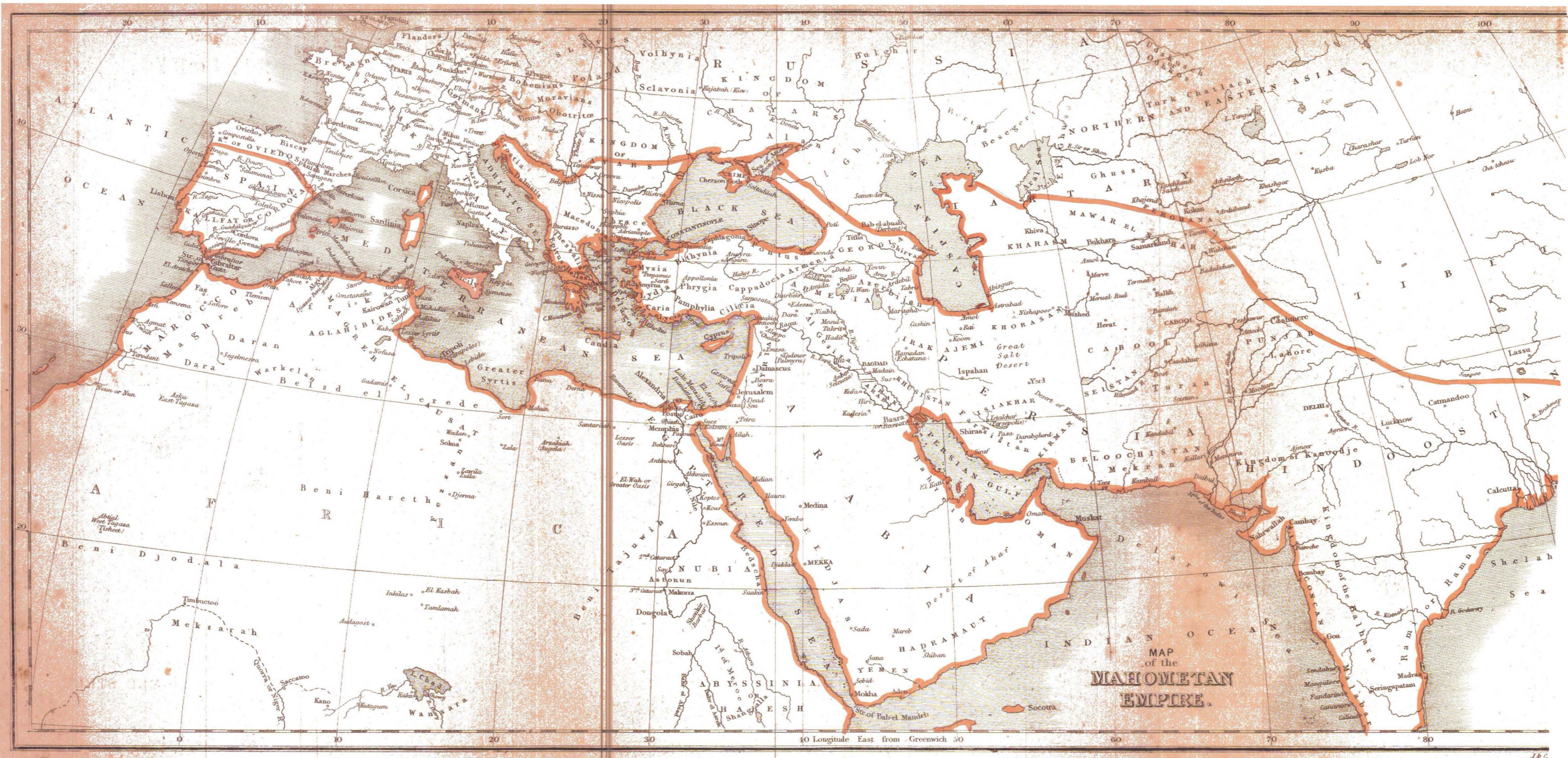
MAP of the MAHOMETAN EMPIRE.

Longitude East from Greenwich 50 60 70 80