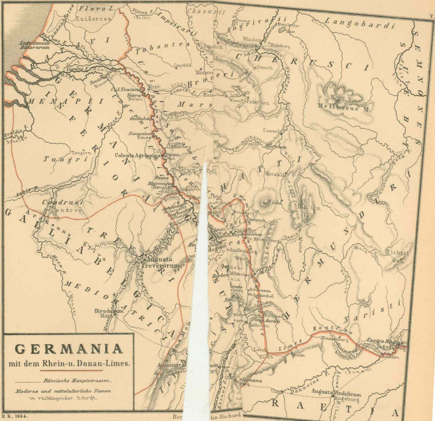
GERMANIA mit dem Rhein- u. Donau-Limes. — Römische Hauptstrassen. Moderne und mittelalterliche Namen in rückliegender Schrift.