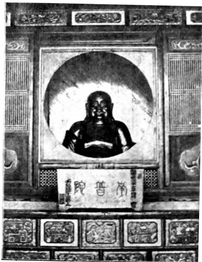
IDOL AT THE RACE-COURSE, AMOY.