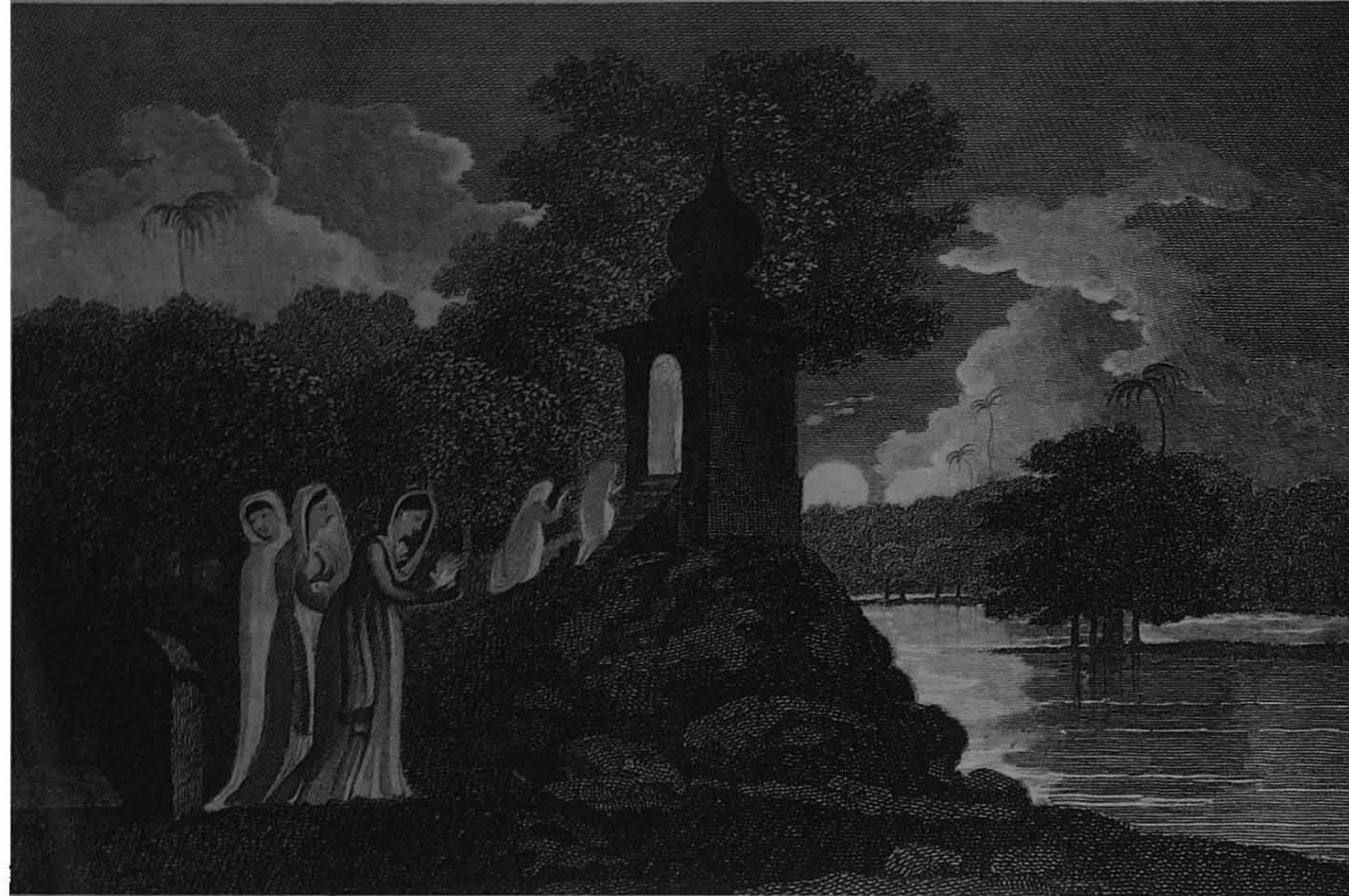
MUHAMMADAN WOMEN MOURNING.