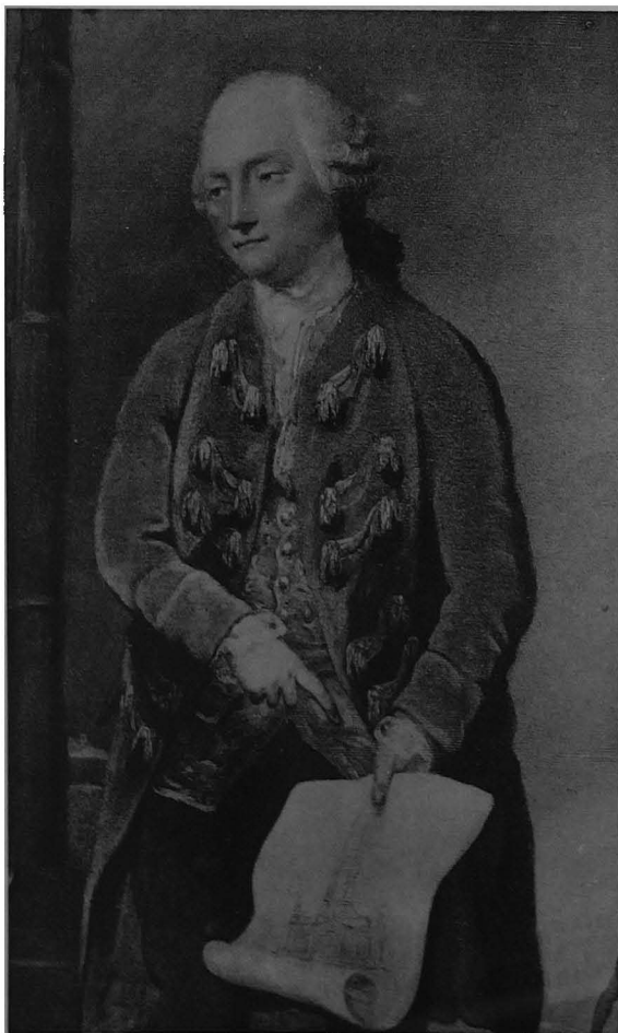
JOHN ZEPHANIAH HOLWELL.