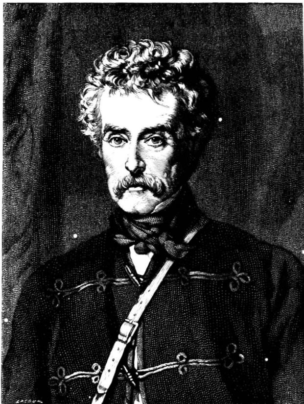
SIR COLIN CAMPBELL, LORD CLYDE

After the Picture by Sir FRANCIS GRANT, P.R.A.