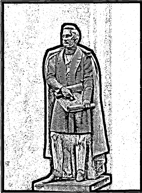
STATUE OF THE MARQUESS OF DALHOUSIE