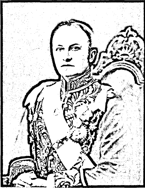
Lord Curzon as Viceroy of India.