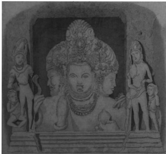
ELEPHANTA CAVE, BOMBAY.