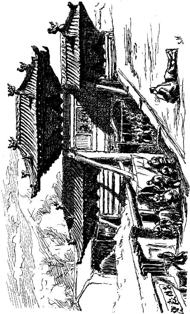
AN ORNAMENTAL GATE IN THE INTERIOR OF SI-NING-FU