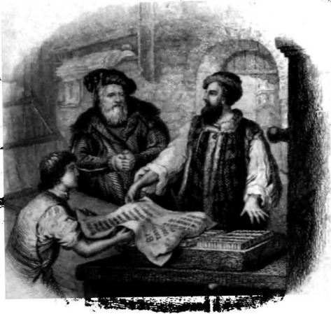
THE FIRST PRINTED BIBLE

As if to reach the noblest purpose to which the art would ever be applied, the first book printed with moveable metal types and as beautifully was the BIBLE. Page 750