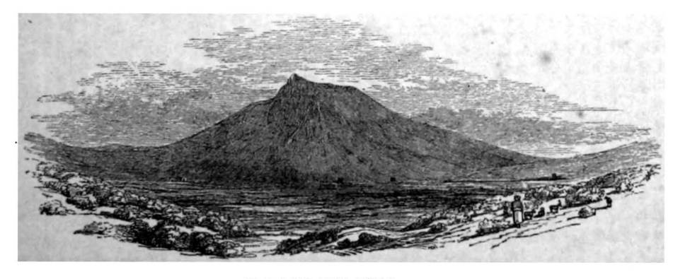
KARA-DAGH, NEAR LYSTRA.