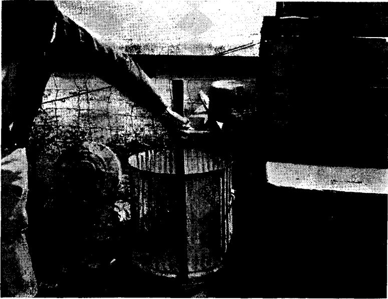
Fig. 1. Straight-sided tank from which cows were watered outside the barn and calibrated gauge for measuring volume of water.

The behavior of the animals was normal during the entire trial. They were healthy and had good appetites, and at no time was a cow really off-feed. No cow lost weight during the experiment, while most of them gained.