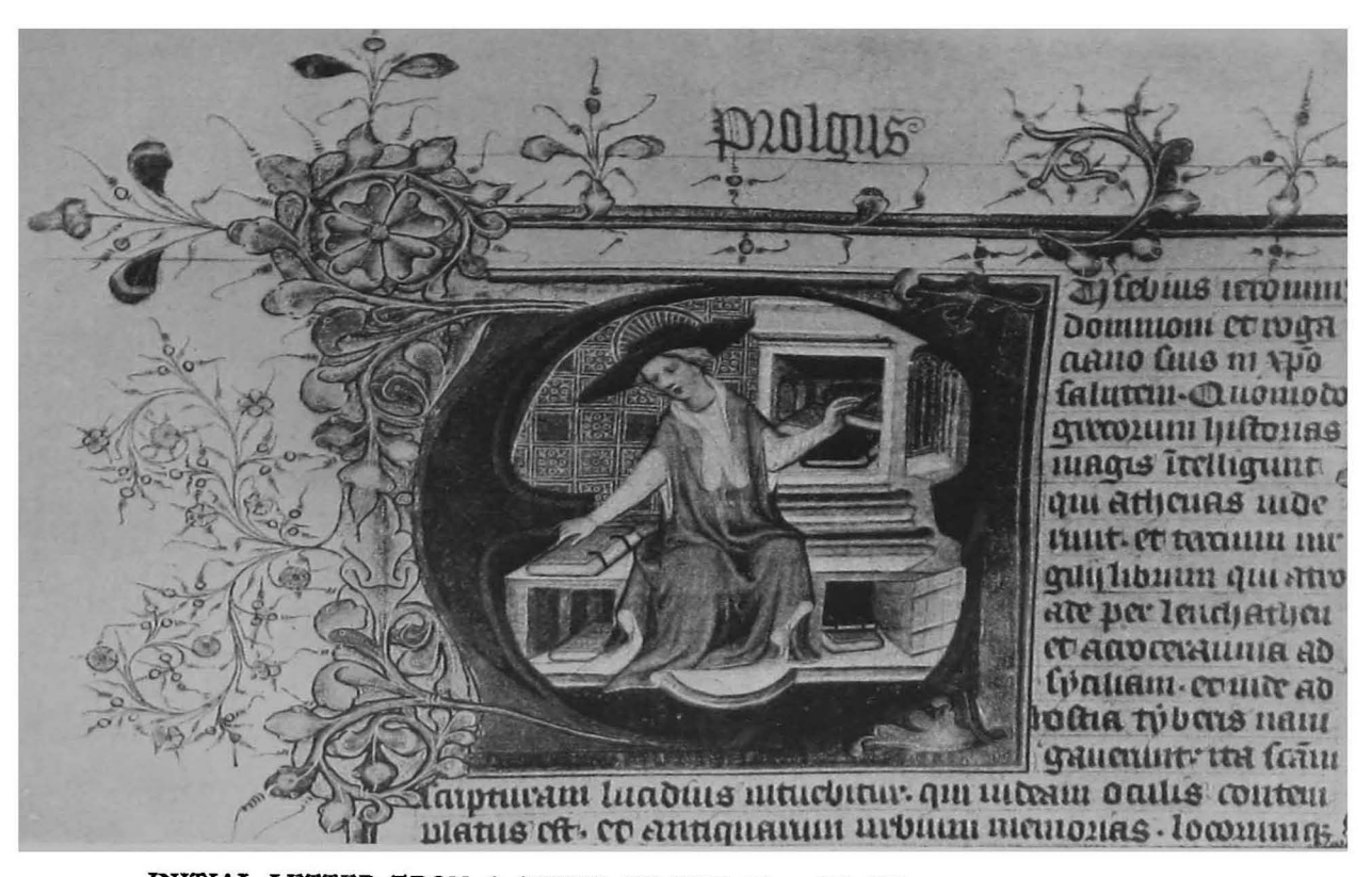
INITIAL LETTER FROM A BIBLE OF THE 14TH CENTURY (ROYAL MS. IE. 1X)