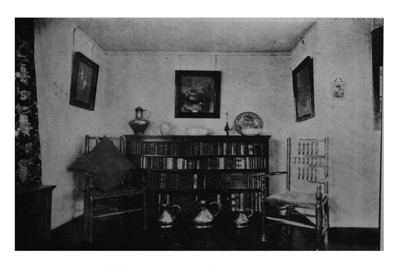
THE HOME OF THE AUTHOR'S MANUSCRIPTS