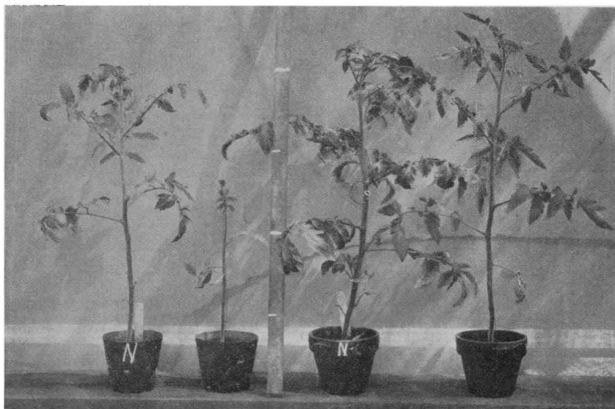
Fig. 2.—Nitrogen Deficiency in Paper Pots.

On the same day that the plants were measured, they were photographed (Figure 2).