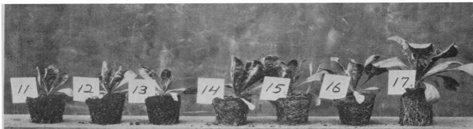
Fig. 1.—Calendula Plants, 40 days in 4-inch containers.

The habit of growth in the paraffined paper pots was quite similar to growth obtained when a nutrient deficiency exists. The leaves of the plant turned to a yellow green and became stiff. New leaves grew slowly and remained small. These plants resembled plants that have been exposed to very cool temperatures or have been put on a ration of a reduced quantity of water. These practices, i. e., cool temperature and little water, are used in the method of "hardening-off" plants either to hold them back in growth or to prepare them for the more rigorous life of field culture. However, the root system was very much unlike the strong root systems of plants that have been hardened-off. The ball of roots with soil was not present. The roots were very few and showed little tendency to branch. This absence of a fibrous root system on the outside of the soil mass was not due to lack of moisture on the outside of the potted soil. The paper pot soon became quite moist and in many cases was penetrated by roots that were working downward on the outside of the pot. Numbers 11 and 12 in Figure 1 show the poor root systems of plants grown in plain paper and paraffined paper pots. Numbers 16 and 17 are plants grown in clay and glass containers, showing excellent root systems.