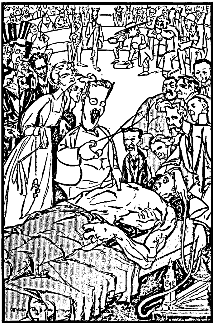
LABOUR'S MEDICAL ADVISERS A DEMONSTRATION IN THE NEW STATESMANSHIP