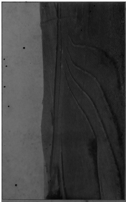
OPEN FIELDS AND BALKS AT CLOTHALL, HERTS.