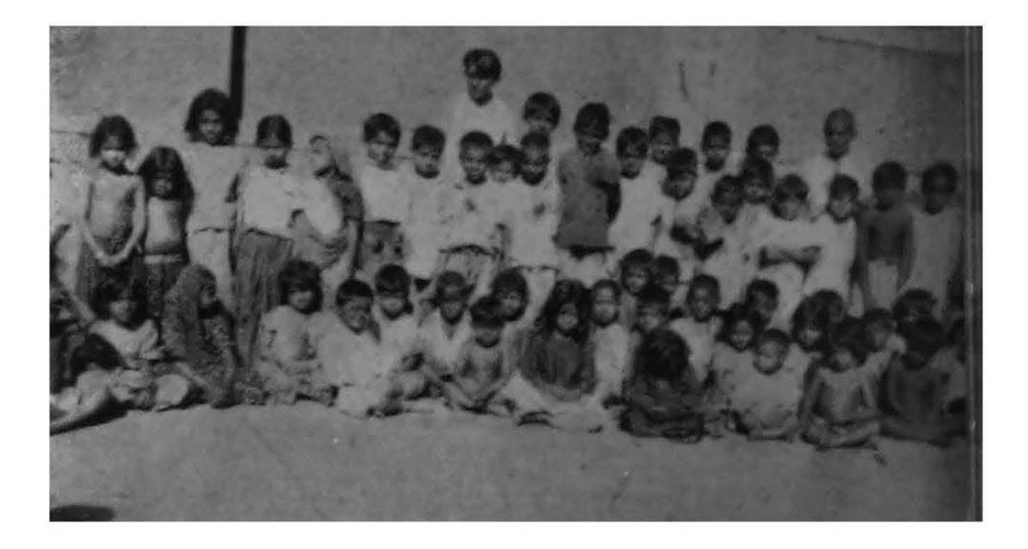
Some Children of the Untouchable Classes.