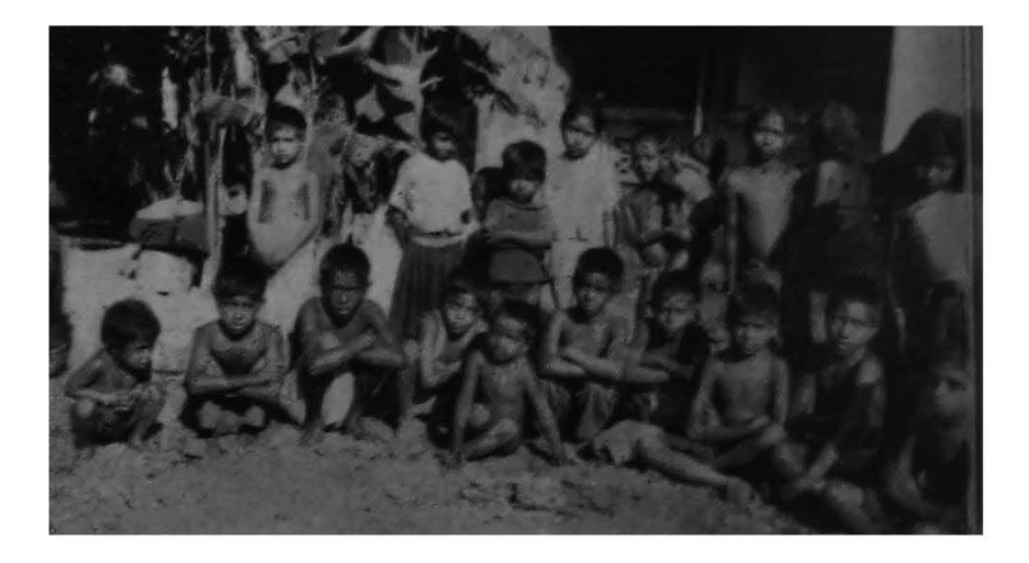
Some Children of the Untouchable Classes.