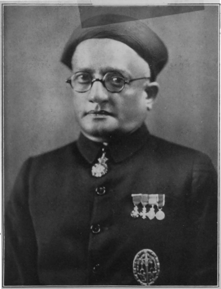
Sir Purshotamdas Thakurdas, Kt., C.I.E., M.B.E., Chairman of the B. E. S. & T. Co., Ltd., since 1926.