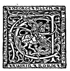
GEORGE ALLEN & UNWIN LTD. LONDON: 40 MUSEUM STREET, W.C. I CAPE TOWN: 73 ST. GEORGE'S STREET SYDNEY, N.S.W.: WYNWARD SQUARE WELLINGTON, N.Z.: 4 WILLIS STREET