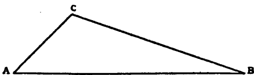
Illustration. connected by rail and having also an indirect connection by another line. Assume also that on this second line there is a town C. Diagrammatically the position may be illustrated as below—

The company with the direct route between A and B has its maximum scale charge fixed by Act of Parliament and is unable to exceed this scale, though it may reduce its rates as much below the scale as its governing officials consider expedient. It has already been seen that whatever is the rate for the direct journey cannot be exceeded by the longer indirect line through C. The company having the connection via C finds it worth while to come down to the level of the rate for the shorter direct route and does so. At C, however, there is no competition, so the scale rates are adhered