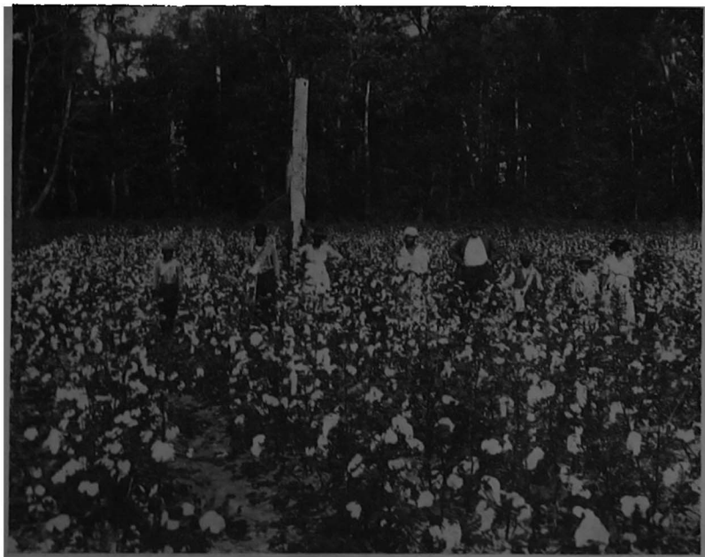
A COTTON PLANTATION