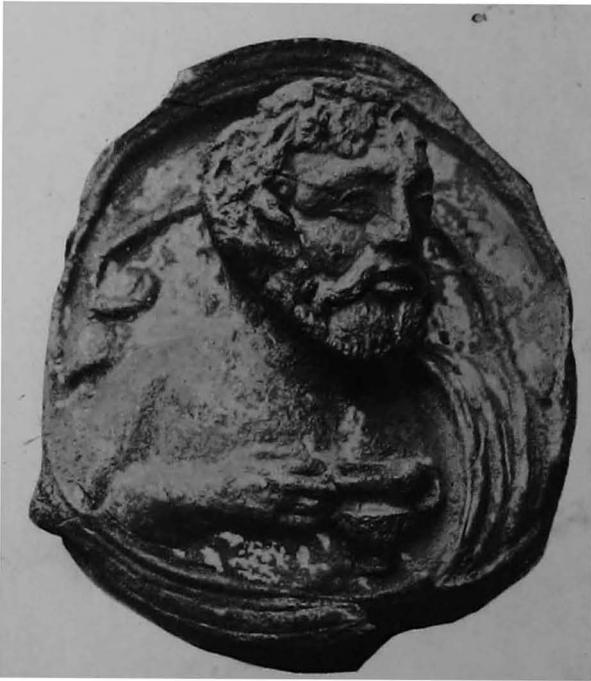
HEAD OF DIONYSUS, SIRKAP.