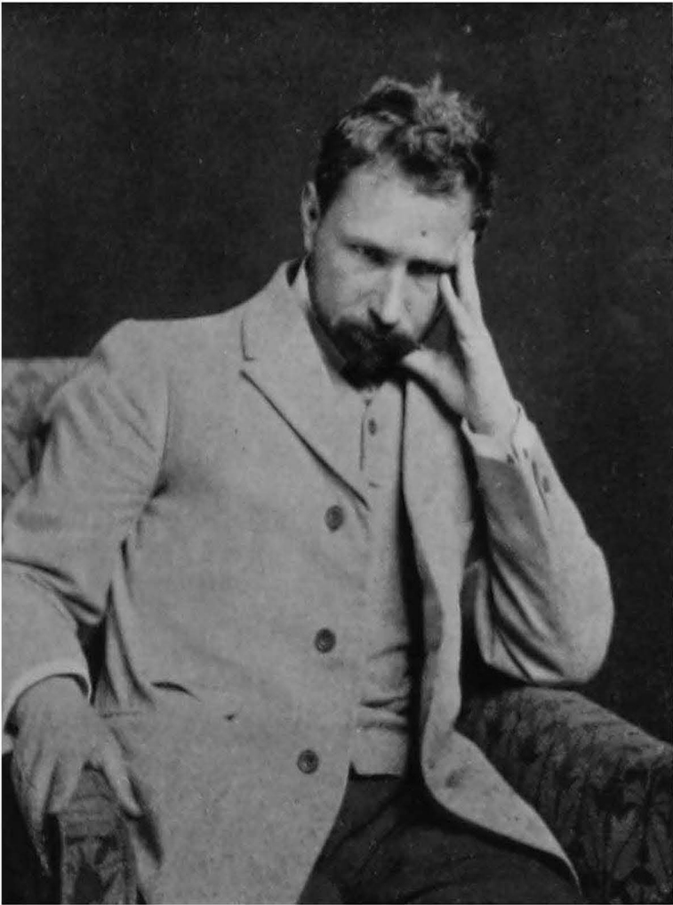
GAPON IN LONDON, 1905.