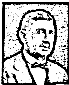
SENATOR BRIGGS (Chairman of the S.A. Trades Union Congress).