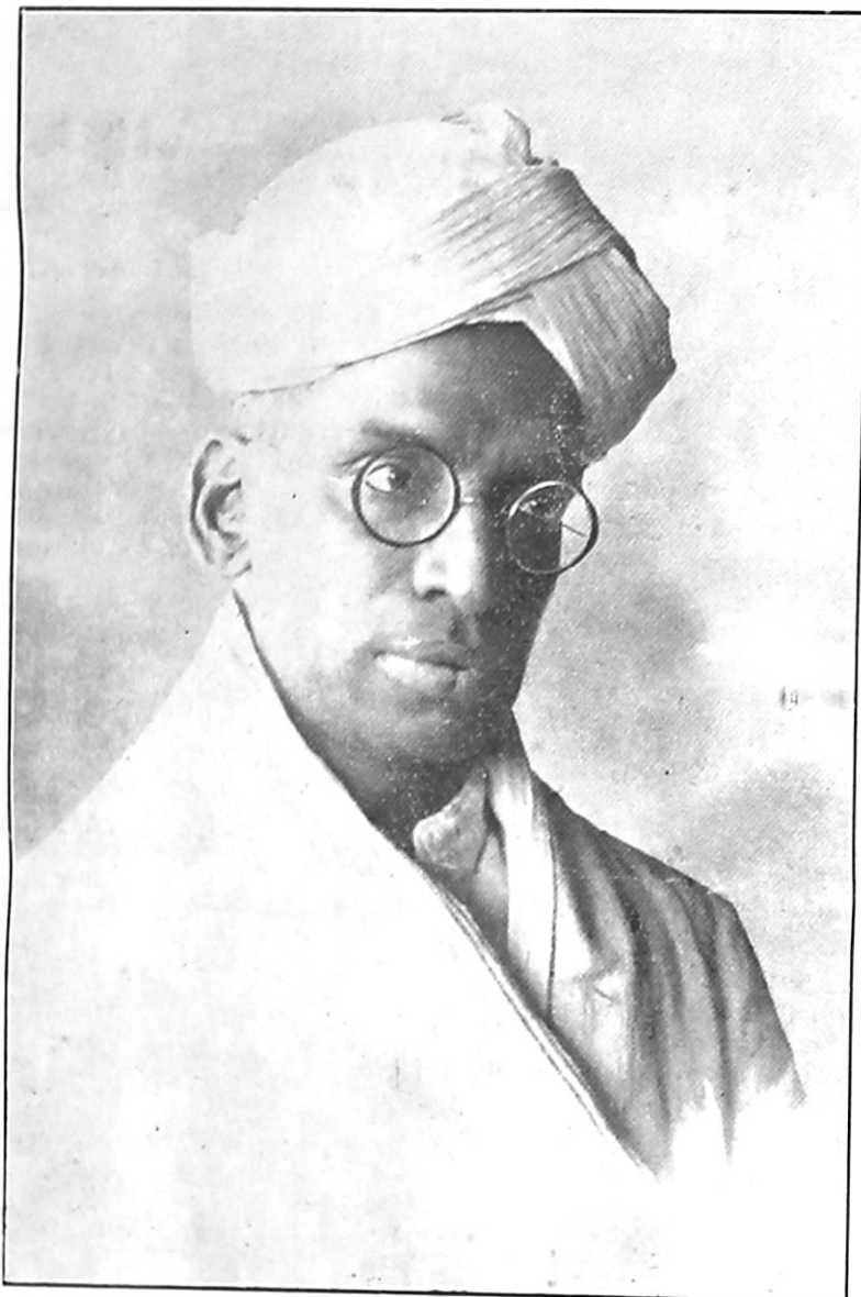
MR. A. RANGASWAMY IYENGAR. One of the foremost National Leaders of India. Editor of "THE HINDU" Madras. WHO DIED ON 5TH FEBRUARY, 1934.

શ્રીયુત એ. રંગસ્વામી આયંગર, હિંદના એક આગેવાન નેતા, અને મદ્રાસના "ધી હિંદુ" જાપાના અધિપતિ, જન્મે તા. ૫-૨-૩૪ ના સ્વર્ગવાસ પામ્યા છે.