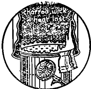
Laurel will not do this.

THE flame of your lamp or PERFECTION Stove cannot burn true with a charred wick. Heat is lost—the wick becomes uneven, and soon is useless. Avoid this by using Laurel. Laurel does not char the wick—it burns longest and brightest of all oils.