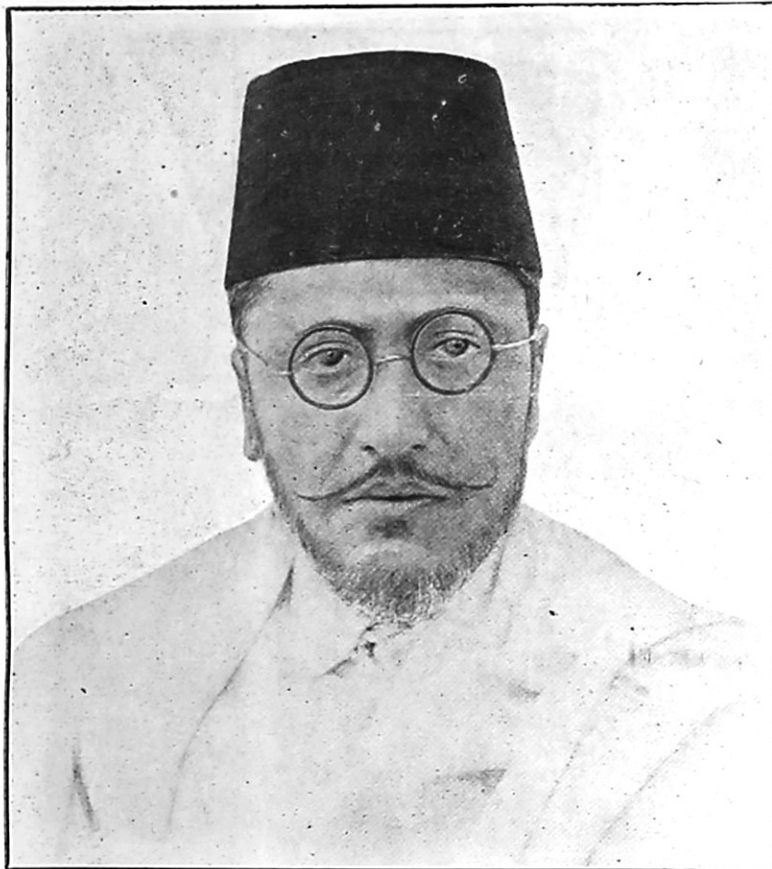
Acting President of the Indian National Congress.