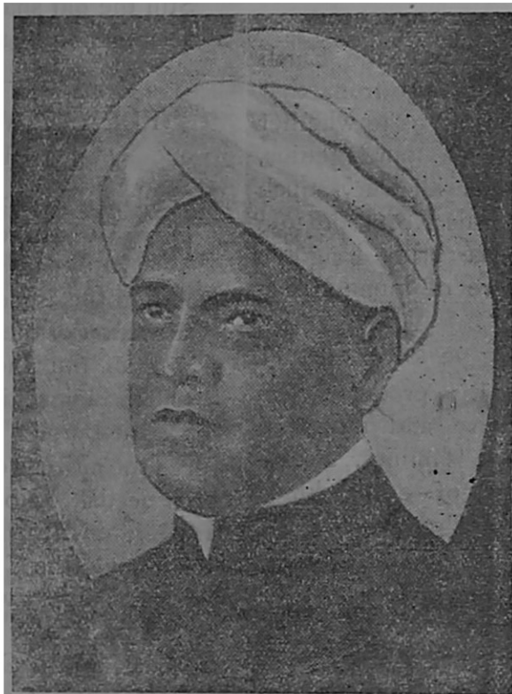
The Rt. Hon. V. S. SRINIVASA SASTRI P.C., C.H.

What these safeguards and guarantees should be, by what means they are to be enforced while they last, and when or in what circumstances they may be removed from the Constitution, are complicated questions which must be settled at the Round Table Conference. It is no good trying to anticipate them now. One distinction, however, is of great importance. The