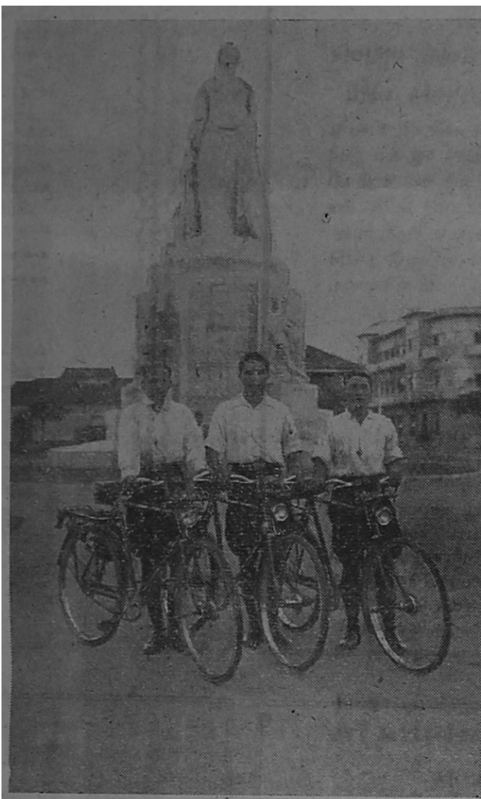
Three Indian Cyclists who are on a world tour and are at present in Durban.