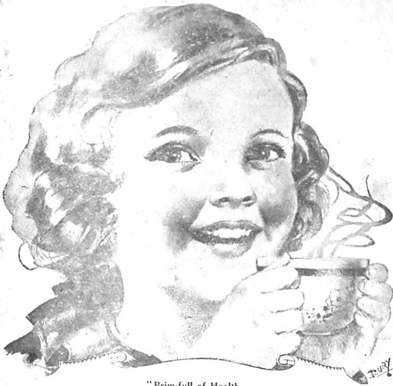
"Brim-full of Health"